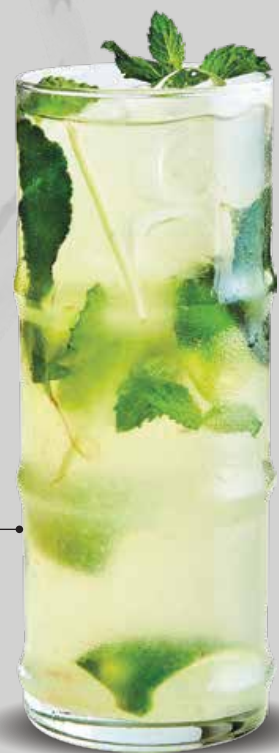
TOM YUM COOLER 冬荫功冷却器