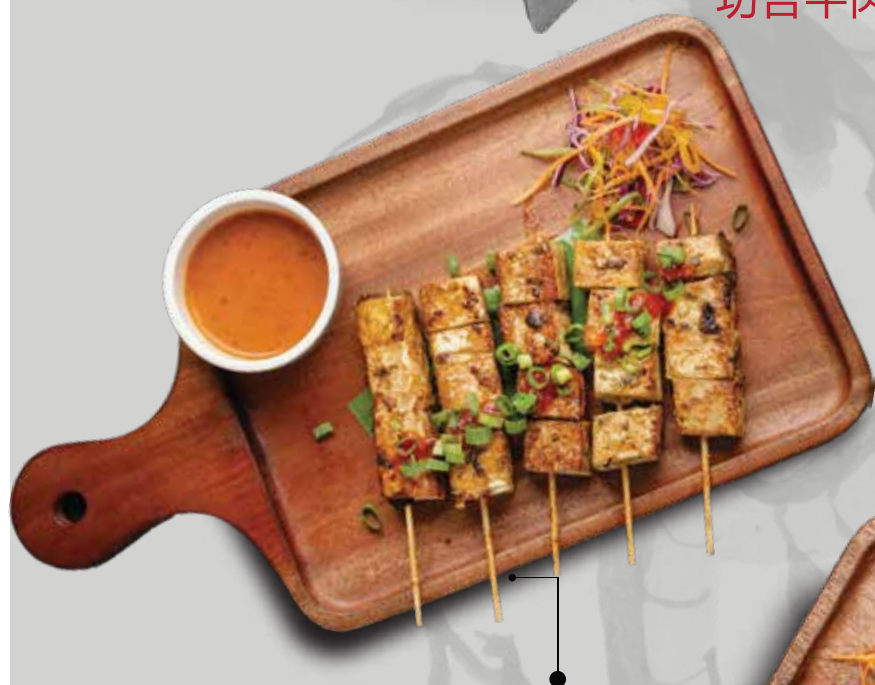
THAI STYLE TOFU SATAY 泰式豆腐沙爹