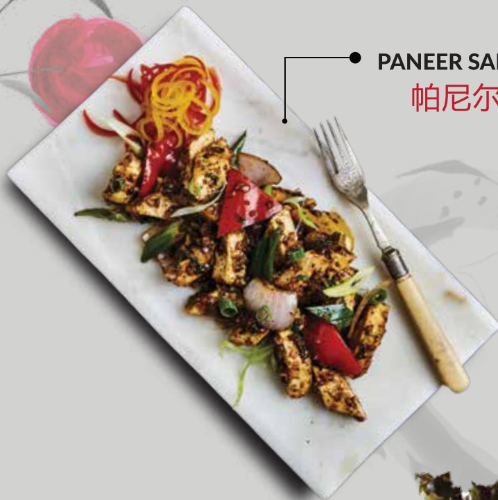
PANEER SALT AND PEPPER