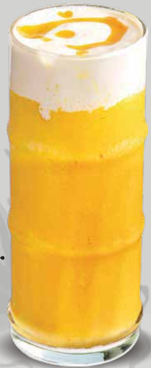
TROPICAL BLAST 热带风暴