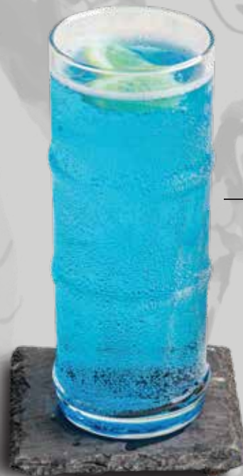
ELECTRIC LEMONADE 电动柠檬水