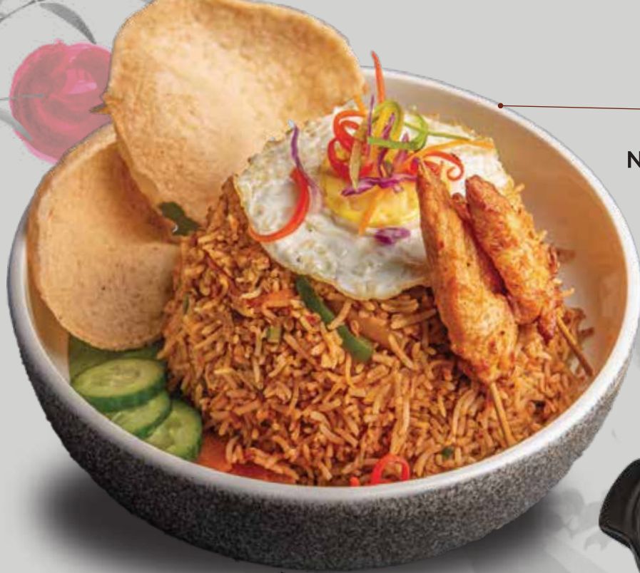
NASI GORENG 炒饭