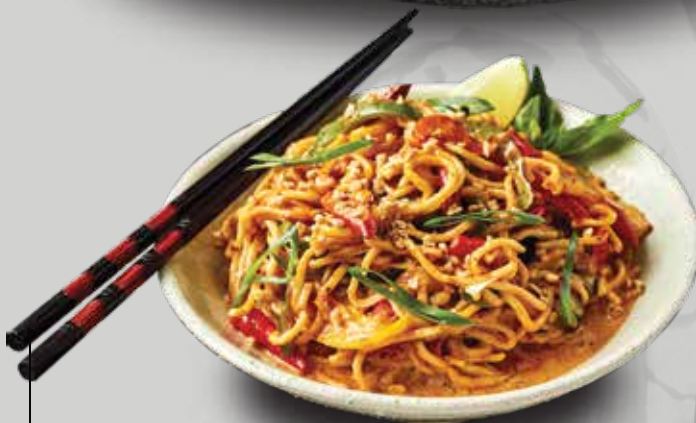
DRAGON CURRY NOODLES 冬阴功汤