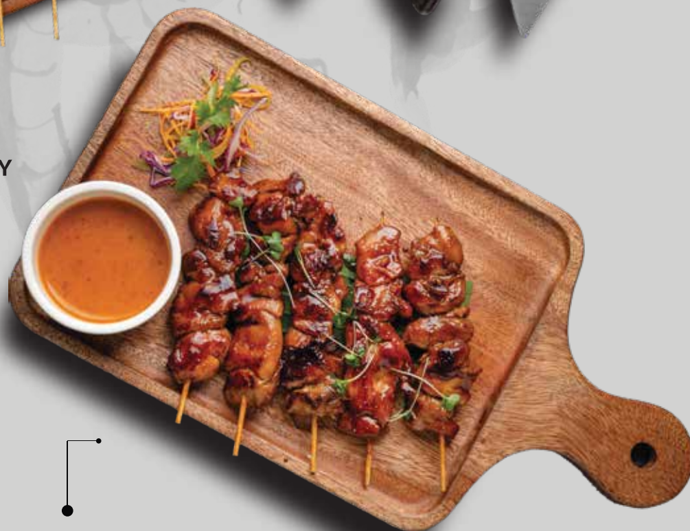
INDONESIAN CHICKEN SATAY 印尼鸡肉沙爹