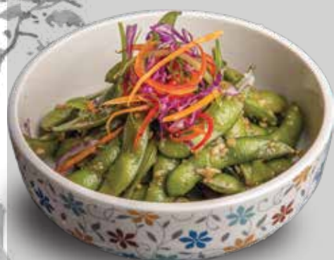
EDAMAME SALTED 盐渍毛豆