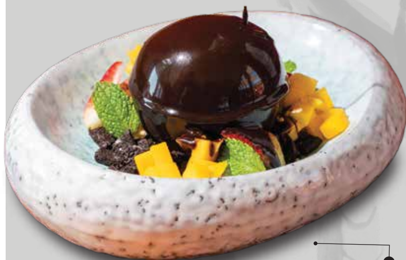
GOLDEN DRAGON SPHERE