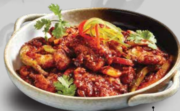
FISH IN ASIAN SPICES