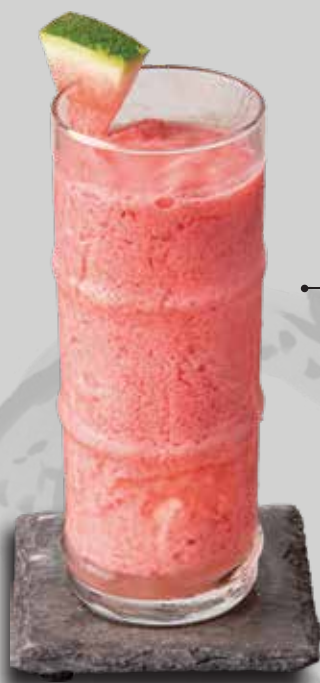
SIP SIP 啜饮