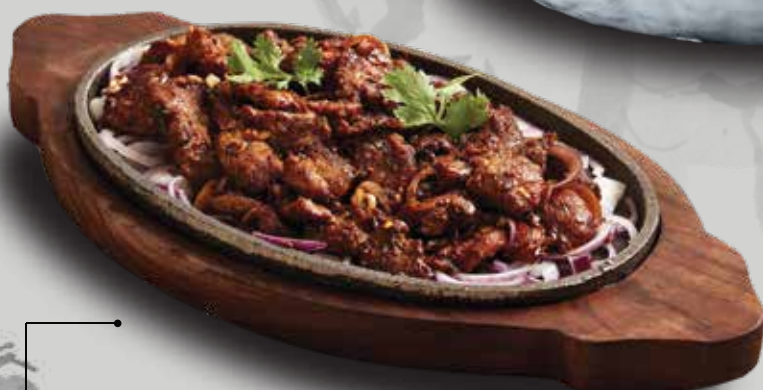
CUMIN LAMB SIZZLER