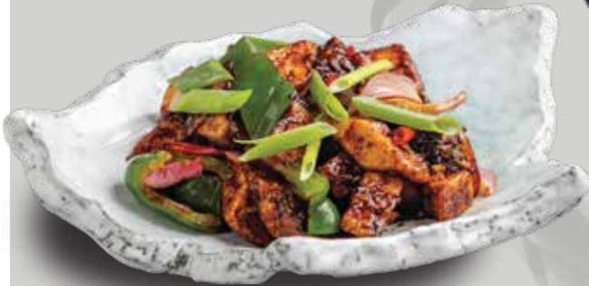
PANEER CHILLI 芝士辣椒