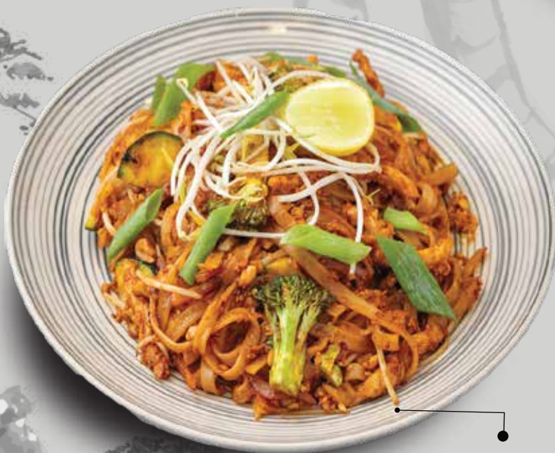
PAD THAI NOODLE 泰式炒河粉