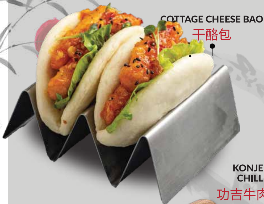
COTTAGE CHEESE BAO 干酪包