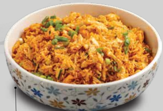
SCHEZWAN FRIED RICE 川菜炒饭