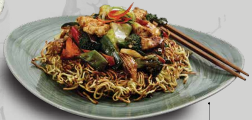
PAN FRIED NOODLES 炒面