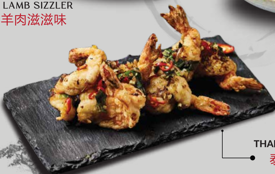
THAI CHILLI PRAWNS