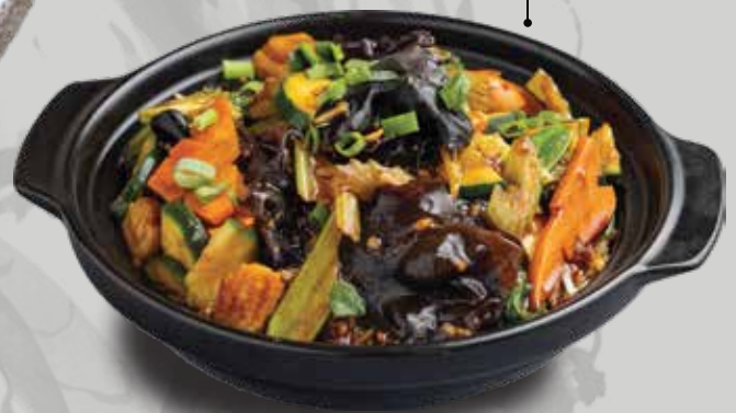
DRAGON POT RICE 龙锅饭