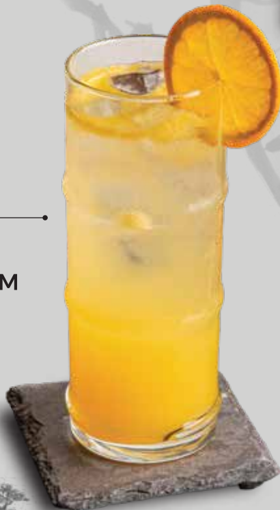
THAILAND SIAM 泰国 暹罗