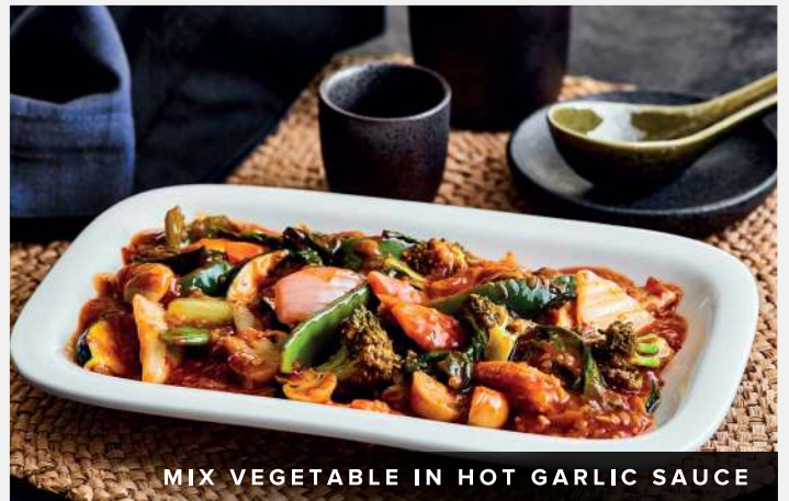
MIX VEGETABLE IN HOT GARLIC SAUCE

خضار صينية مقلية Selected fresh Chinese green vegetables tossed with crushed garlic.