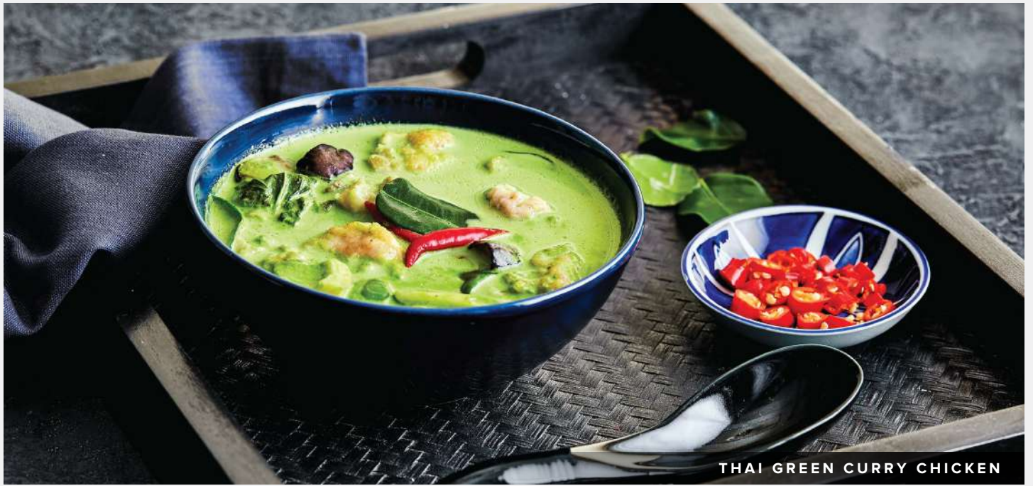
THAI GREEN CURRY CHICKEN