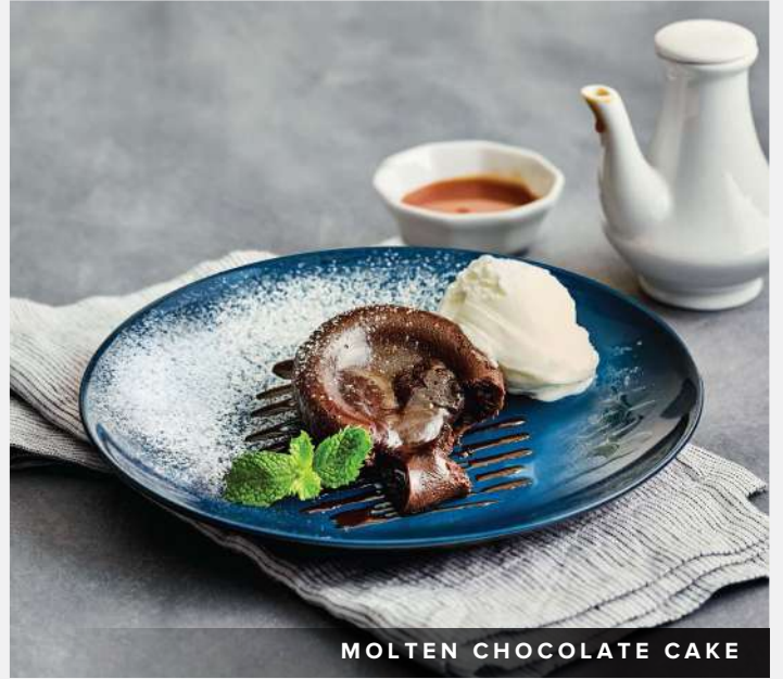
MOLTEN CHOCOLATE CAKE

A scoop of vanilla ice cream encrusted with bread crumbs, deep-fried.