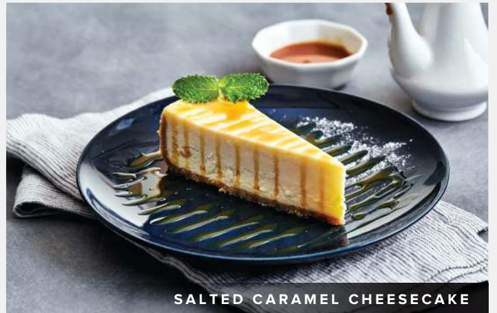
SALTED CARAMEL CHEESECAKE