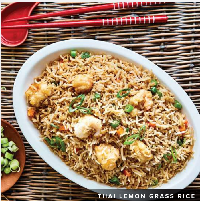
THAI LEMON GRASS RICE

أرز بالثوم المحمر Wok tossed rice in burnt garlic with spring onion