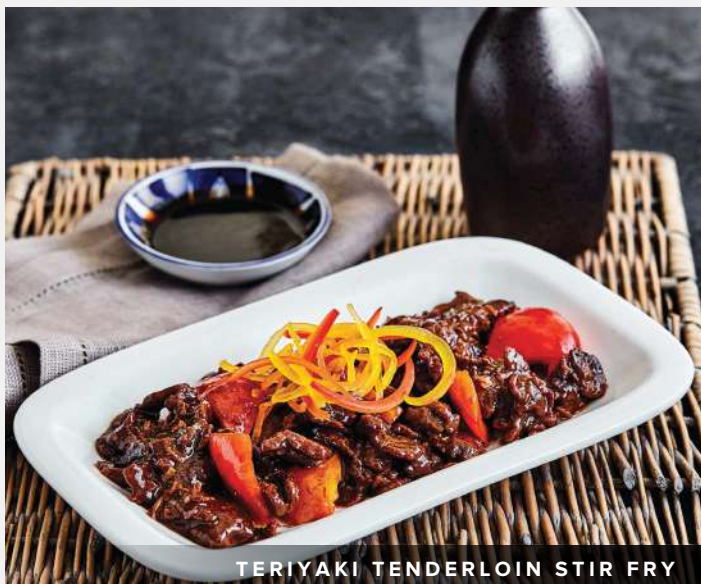
TERIYAKI TENDERLOIN STIR FRY

لحم بقري مقلي مع صلصة ترياكي Sliced beef stir fried in teriyaki sauce with red pepper and carrot.