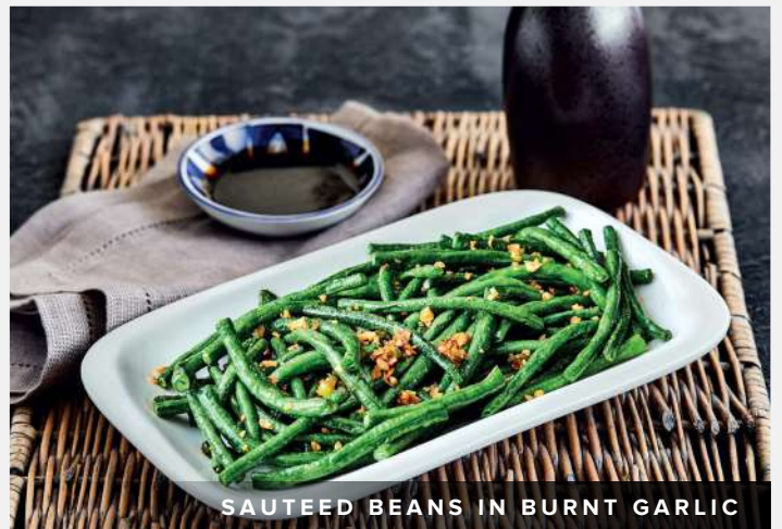
SAUTEED BEANS IN BURNT GARLIC

بوك شوي مع صلصة الصويا الخفيفة Bok choy and asparagus stir fried in soya sauce.