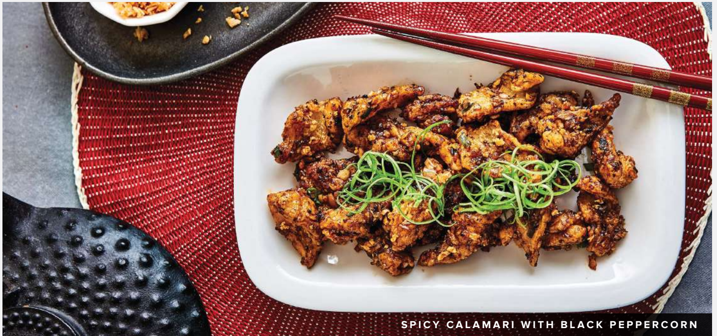
SPICY CALAMARI WITH BLACK PEPPERCORN