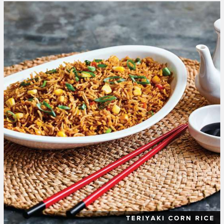
TERIYAKI CORN RICE