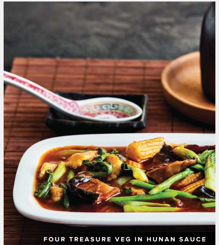
FOUR TREASURE VEG IN HUNAN SAUCE