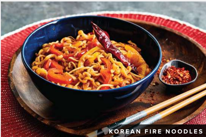
KOREAN FIRE NOODLES