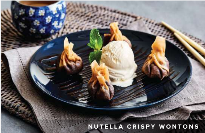
NUTELLA CRISPY WONTONS