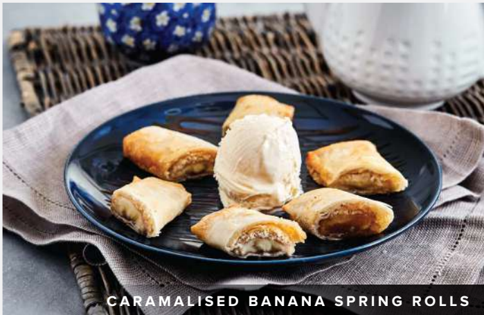
CARAMELISED BANANA SPRING ROLLS