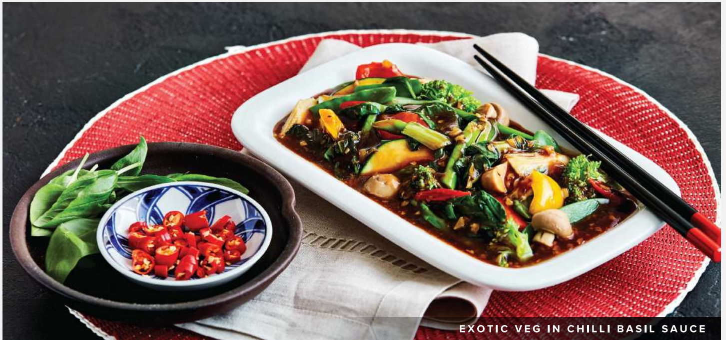
EXOTIC VEG IN CHILLI BASIL SAUCE