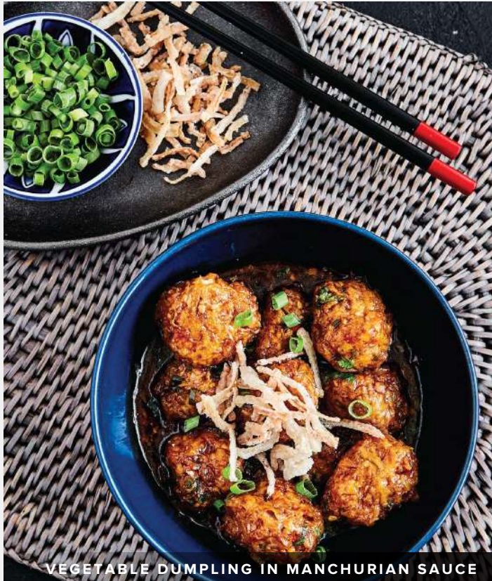
VEGETABLE DUMPLING IN MANCHURIAN SAUCE

خضر بالكاري الأخضر التايلندي Asian vegetables simmered in a classic green curry & coconut milk with kaffir lime and fresh basil.