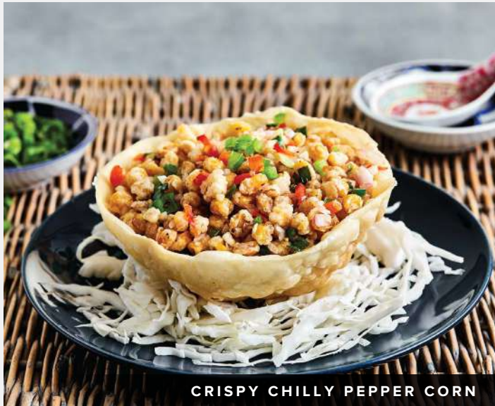
CRISPY CHILLY PEPPER CORN