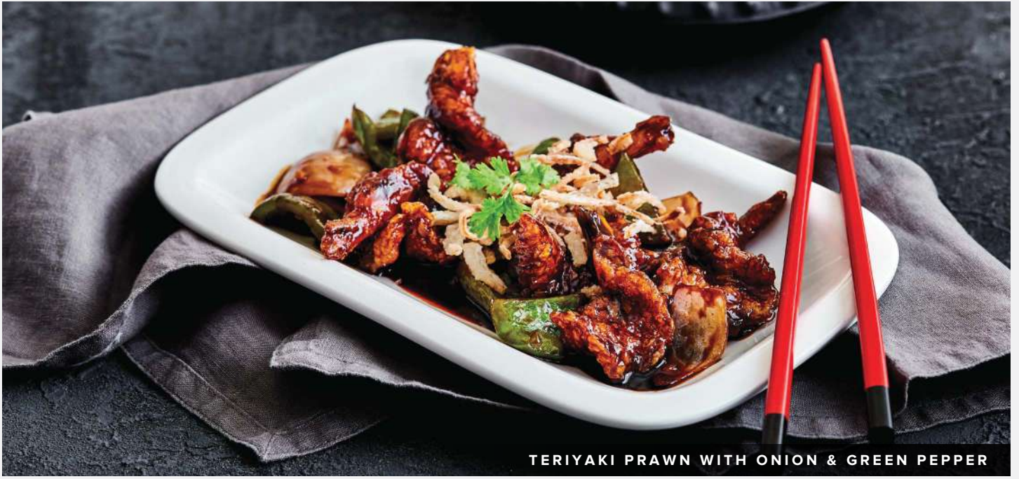
TERIYAKI PRAWN WITH ONION & GREEN PEPPER