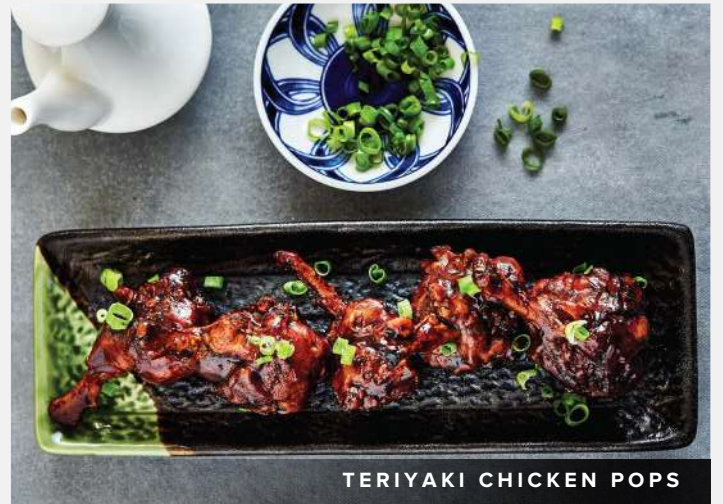
TERIYAKI CHICKEN POPS

دجاج تريياكي لولي بوب Chicken lollipops in sweet Japanese Teriyaki sauce spiked with spring onion