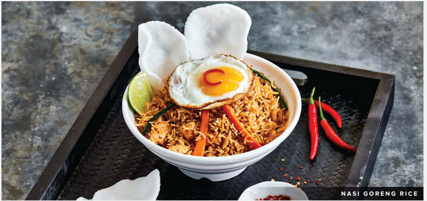
NASI GORENG RICE