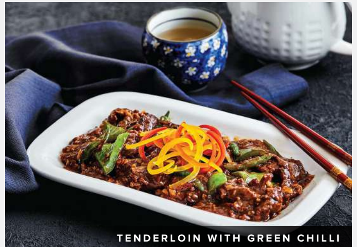
TENDERLOIN WITH GREEN CHILLI

دجاج بصلصة الفلفل الأسود Chicken cooked with green pepper and red onion in black pepper corn sauce.