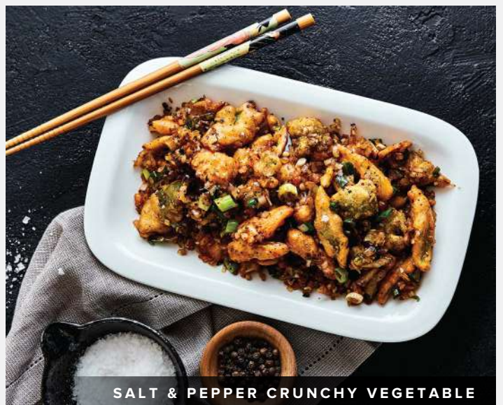
SALT & PEPPER CRUNCHY VEGETABLE

جميع الأسعار شاملة الضريبة All prices are inclusive of tax