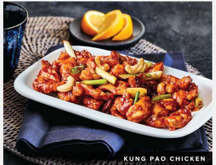
KUNG PAO CHICKEN

دجاج مع العسل و الفلفل Diced Chicken cooked in hoisin sauce with green capsicum and glazed with honey.