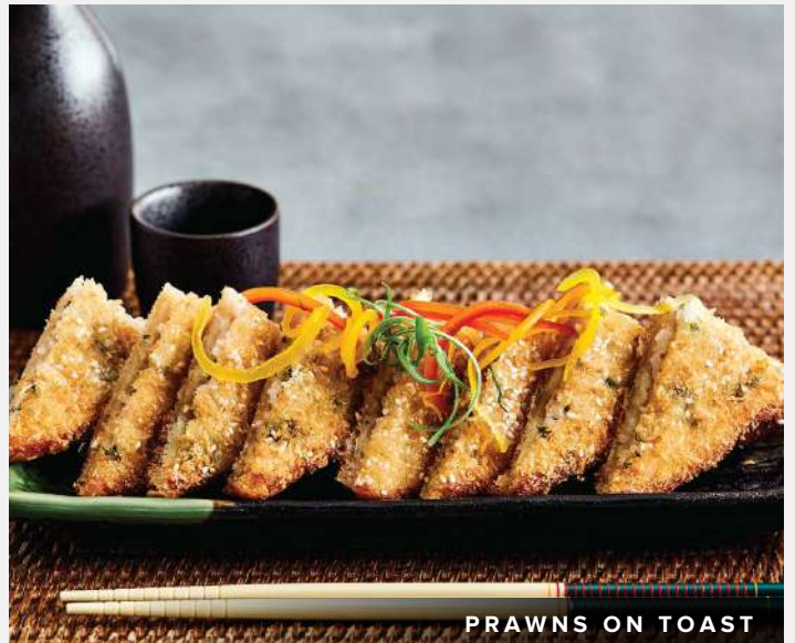
PRAWNS ON TOAST

تنين الروبيان Crispy fried prawns enveloped in a silken tangy sweet mayo chilli and dash of hot sauce.