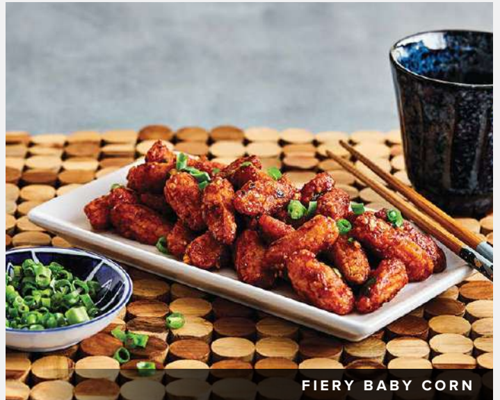
FIERY BABY CORN

لفائف سبرينغ رول Popular Chinese starter with vegetable filling served with sweet chilli sauce.