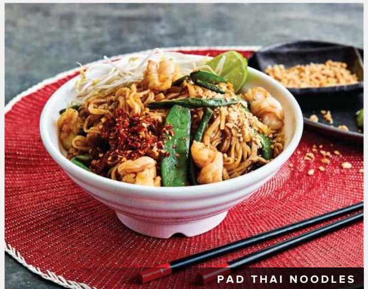
PAD THAI NOODLES

جميع الأسعار شاملة الضريبة All prices are inclusive of tax