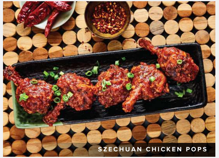
SZECHUAN CHICKEN POPS

تنين الدجاج Stir fried chicken tossed in Asian BBQ sauce with bell peppers & carrot on a bed of crispy noodles.